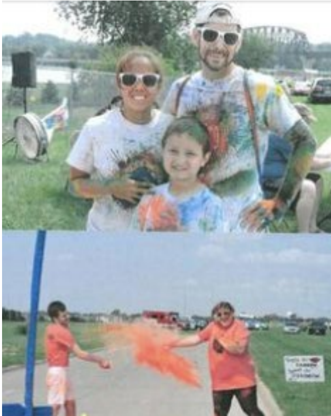
South Sioux City - Colorpalooza