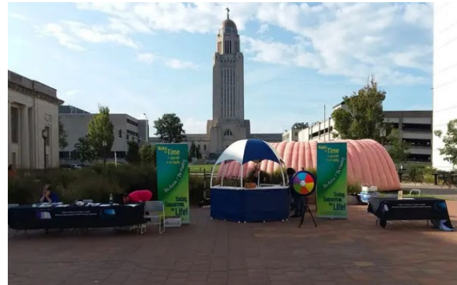
Centennial Mall (Lincoln)